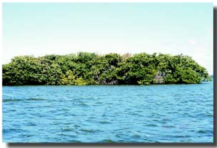
Guachinanguita Island at San José Lagoon.

Appendices: The Appendices include maps associated with certain actions, a list of acronyms and abbreviations, a glossary, a listing of text references, a list of the Management Conference members, tables related to diseases associated with sewage discharges to surface waters and toxics in the SJBE, action plan summary tables, a summary of the comments received on the draft Management Plan and other public involvement activities, and a list of sponsored studies and Action Plan Demonstration Projects.